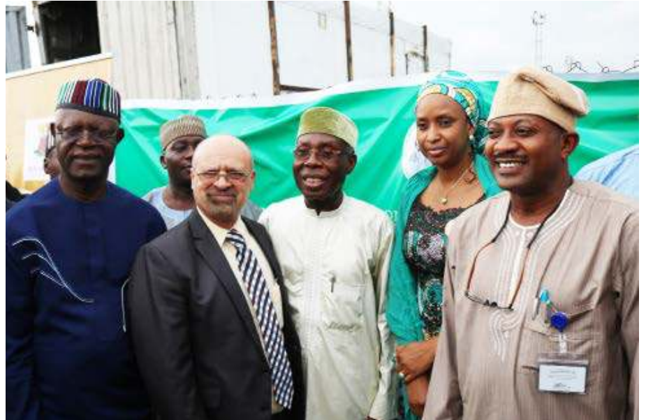
VIPs in the yam export flag-off ceremony in the Lagos port.