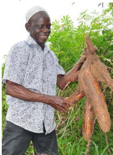
Good cassava harvest.

"Once cassava is harvested, it needs to be sold immediately otherwise the fresh cassava roots will start to deteriorate and cannot be sold at a good price, resulting in high financial loss for the farmers and fresh root traders. It is therefore important to introduce technologies for extending the shelf-life of fresh cassava roots or processing into shelf-stable products such as flour, chips and starch," said Abass.