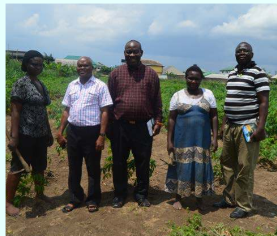
Team of IITA Onne pose for a group photo with the director, School to Land and some trainees.

School to Land Authority, about its work on livestock farming, fishery crop production, and processing. The visit was wrapped up with a tour around the facilities of the institutions.