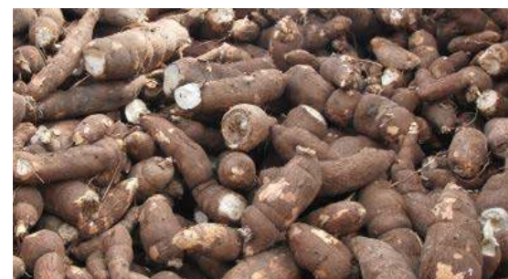
More cassava for processing.

"With proper delivery of the technologies and value chain arrangements, Africa can compete favorably with the rest of the world," Abass said.